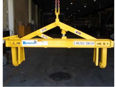
This three-ton supporting tong lifts rolls of steel belting.