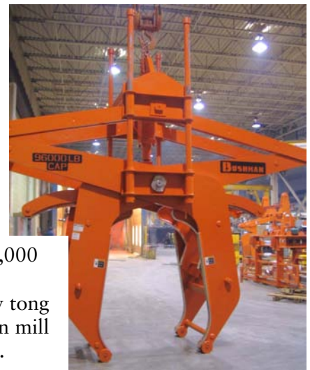
This 96,000 pound capacity tong lifts twin mill roll sets.