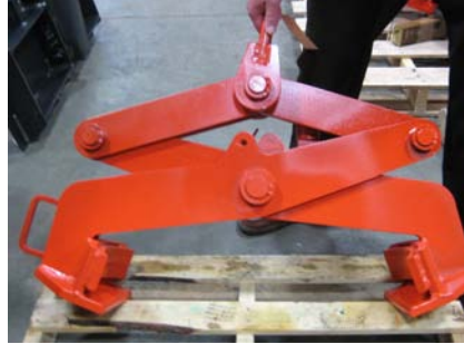
This supporting tong has a locking pin.