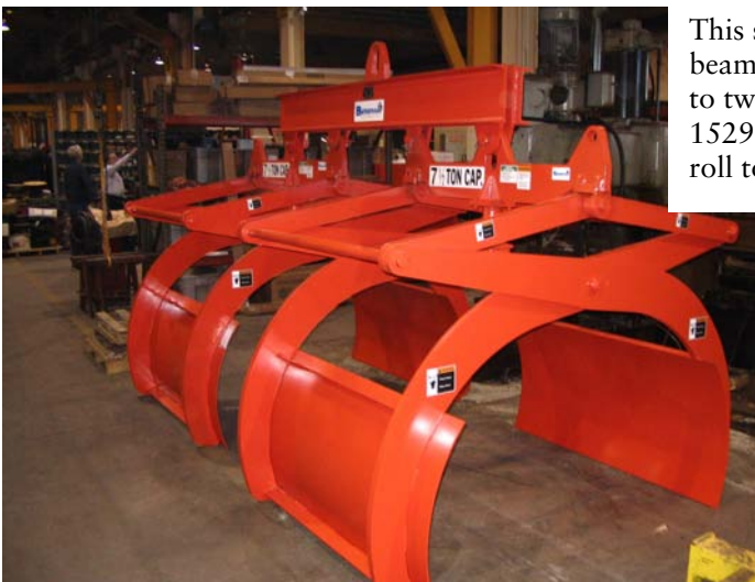
This spreader beam connects to two Model 1529 paper roll tongs.