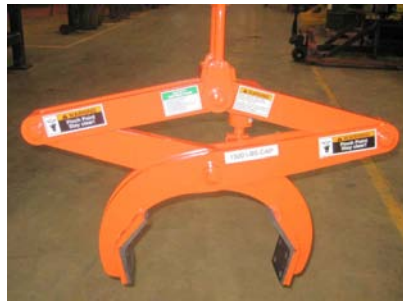
1,500 pound gripping tong with rubber pads for handling loads of various diameters