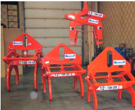
These Model 1529 mill roll tongs lift round steel ingots from 12 to 40 inches in diameter and weighing up to 50,000 pounds.

Gripping tongs extend beyond and below the center of the load to provide additional support.