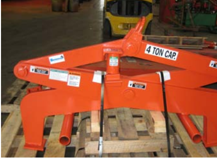
Four-ton Model 1003 is a supporting tong.

Supporting tongs lift the load from underneath. The lifting feet can be shaped specifically for the load.