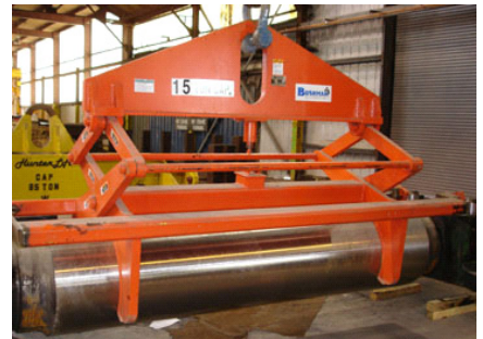
This roll tong lifts 22.5 to 25 inch diameter mill rolls. The legs have bronze wear pads to protect the roll surface.