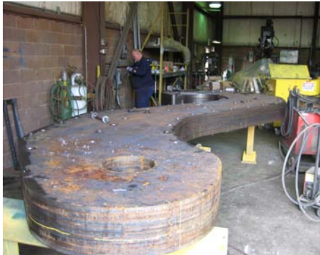
#1 Laminated hook plates are leveled, flame cut, predrilled and then tack welded together.