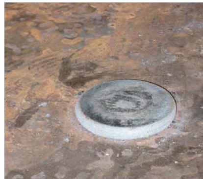
#7 Properly punched rivet