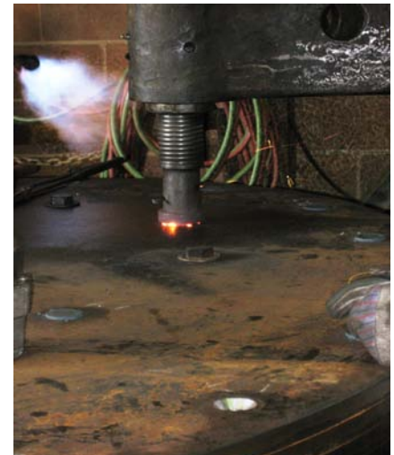
#6 Rivet is punched using the riveting machine.