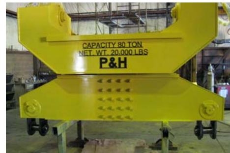
An 80-ton capacity reeved in power rotating ladle beam with fabricated chase blocks and ladle hooks with bronze palm bushings and hardened steel eye bushings.