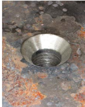
#2 Hook plate holes are countersunk.