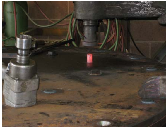
#5 Hot rivet is inserted from bottom side.