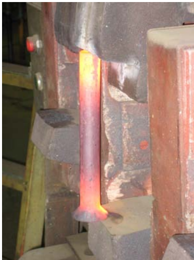
#4 Hook plates are riveted together. Rivets are placed in an electric heater until red hot.