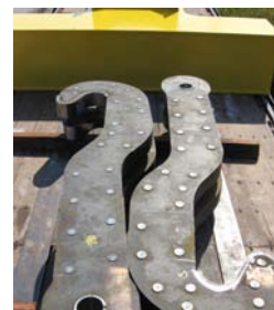
These 80-ton capacity riveted ladle hooks are for the 80ton ladle beam above.