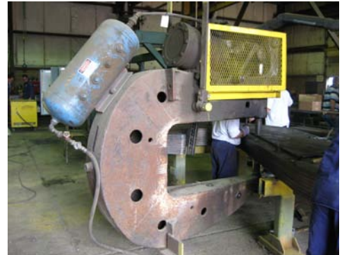
#3 Plate laminations are riveted together using a special air-powered riveting machine.