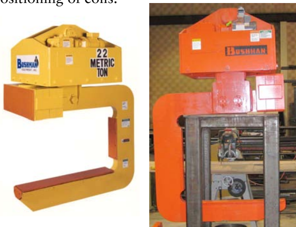
Motorized rotating C-hook sitting in its stand

Bushman's Motorized Rotating C-hook comes equipped with a motorized rotator capable of continuous 360° rotation. This feature provides additional capability for safe and proper positioning of coils.