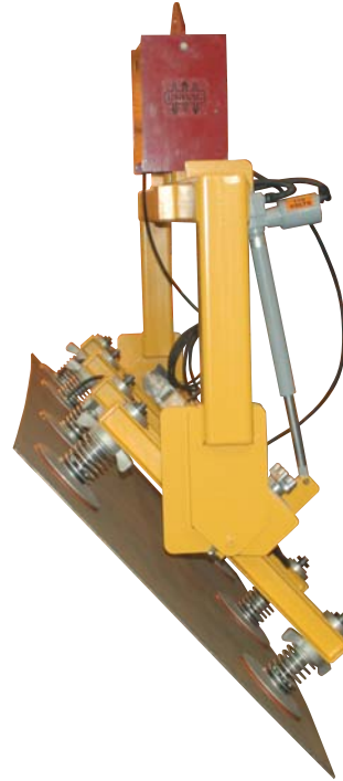
Electric upenders allow the operator to position the plate anywhere from 0 to 90 degrees.