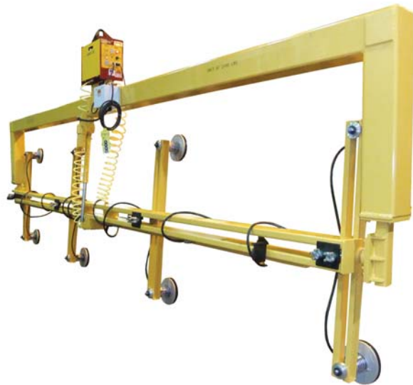
Electric upender shown at 90° position.