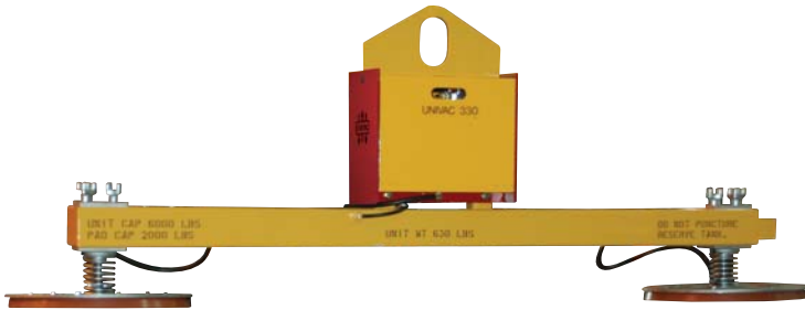
Custom designed bail for large crane hook.

For lifting smaller rectangular shaped material. Width should not exceed 5 times the pad diameter (see specifications below for pad diameter).