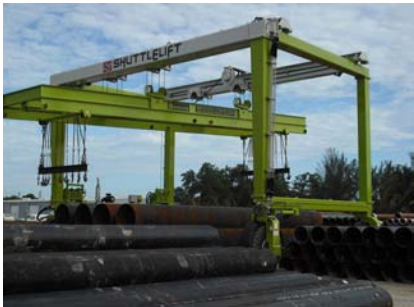
Beam with hydraulically adjustable lifting hooks