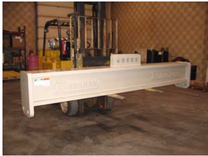
This extreme low temperature beam is made from special steel.