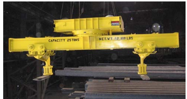
25-ton capacity spreader beam with powered rotation and lifting forks with adjustable spacing for handling hot beam blooms.