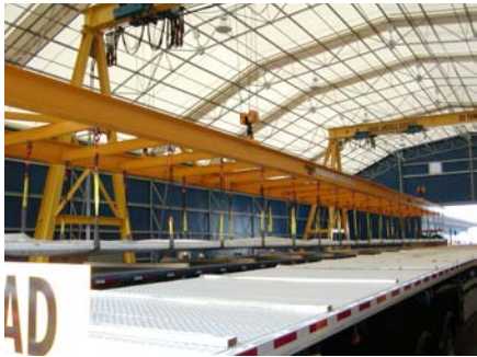
This beam with a very long span is used with two cranes.