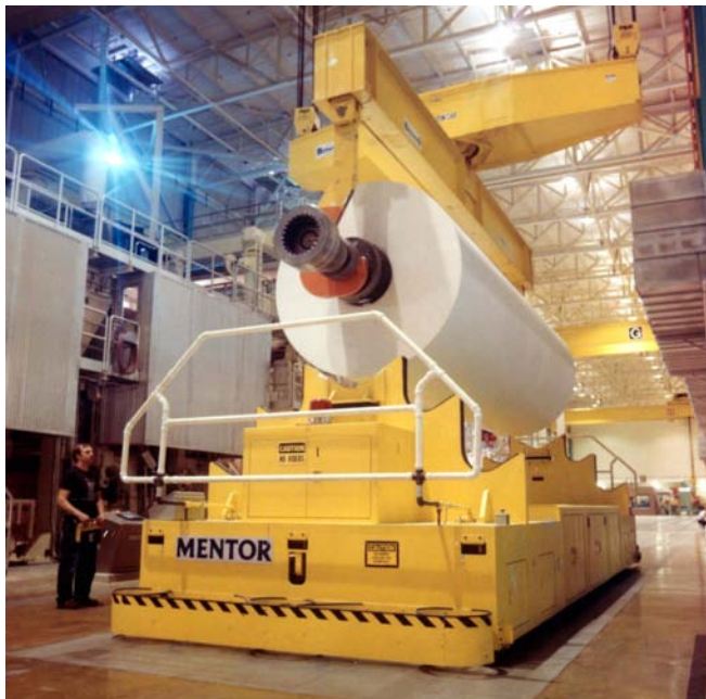
Rotating spreader beam in use at a paper mill.