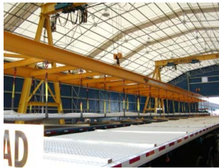
This beam with a very long span is used with two cranes.