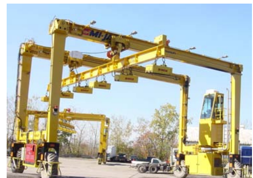
This 20-ton magnet beam attached to a mobile gantry crane has six magnets.