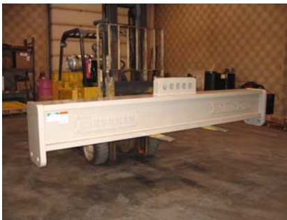
This extreme low temperature beam is made from special steel.