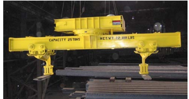
25-ton capacity spreader beam with powered rotation and lifting forks with adjustable spacing for handling hot beam blooms.