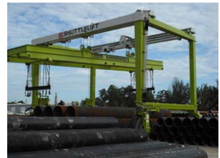
Beam with hydraulically adjustable lifting hooks