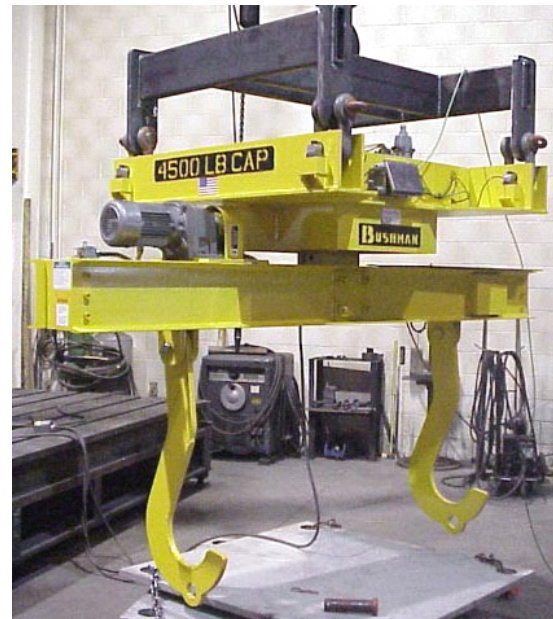
This rotating beam has adjustable J-hooks and an integral weigh scale system.