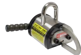
Shown with optional Vertical Lifting Lug attachment