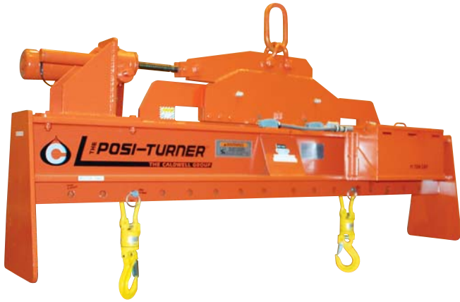
Show with special swivel bearing load hooks.