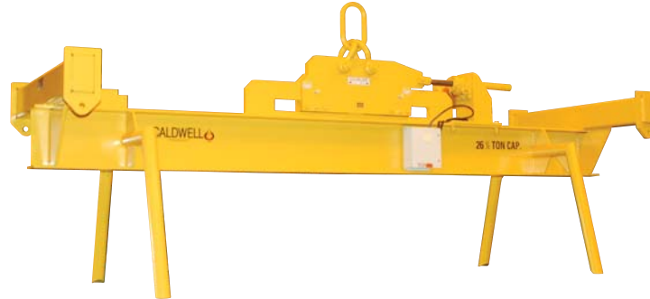
Special 4-point Posi-Leveler™ with load guides.