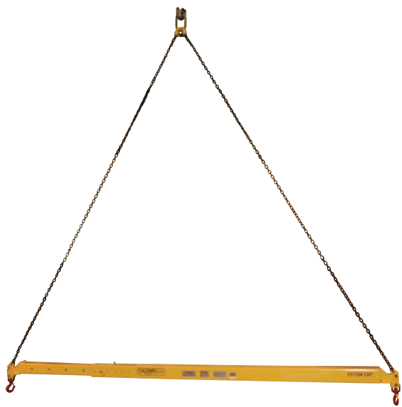
Shown with Option C