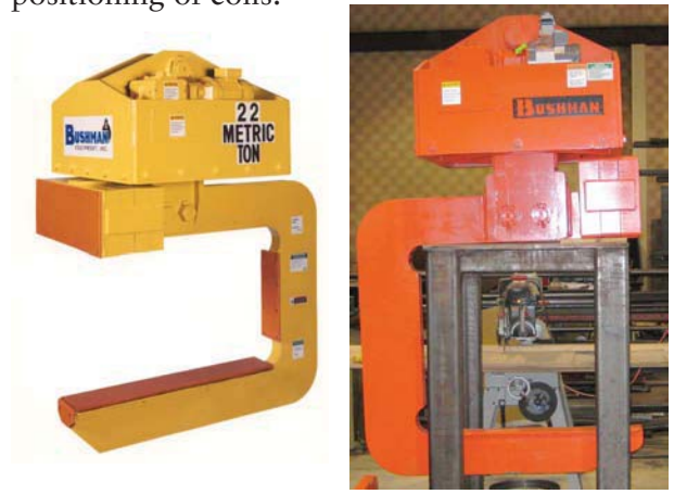
Motorized rotating C-hook sitting in its stand

Bushman's Motorized Rotating C-hook comes equipped with a motorized rotator capable of continuous 360° rotation. This feature provides additional capability for safe and proper positioning of coils.